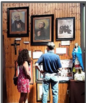
( L ) Visitors review the time line of Shrine history in the museum.

“ Instead of taking the easier route and remaining closed for this season, the Shrine is following the more difficult path of staying open in a limited capacity in compliance with all applicable New York State requirements, which includes allowing visits by individuals and families on the grounds and in the open air Martyrs Chapel, limited museum and gift shop hours, and one Mass per week on Sundays at 9:30am by a priest who is staying at the Shrine on sabbatical, all subject to and in compliance with all applicable safety protocols and guidelines. In light of all of current New York State requirements, group pilgrimages and events by outside groups, and public Mass by visiting priests, however, are not able to be permitted for the duration of this Shrine season. It was our hope that New York State restrictions would have eased at this point, but that has not been the case. We thank you very much for your understanding. We hope that everyone will continue to enjoy and be blessed by visits to the Shrine this season on an individual and family basis. We look forward to once again receiving group pilgrimages and events in 2021.”