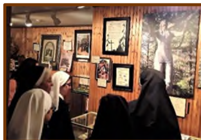
Sr of Parish Visitation of Mary Immaculate