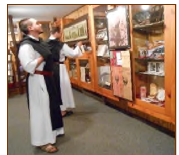
Trappists from Kentucky